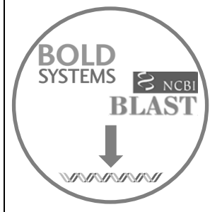
Download all sequence data available for the genus