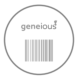
Filtering the data and selecting 'promising' markers