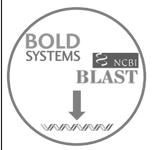
Download all sequence data available for the genus